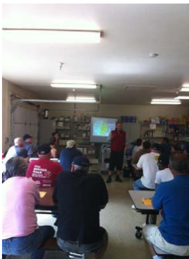
Clients learn bike safety thanks to the SLO Bike Coalition's generosity.