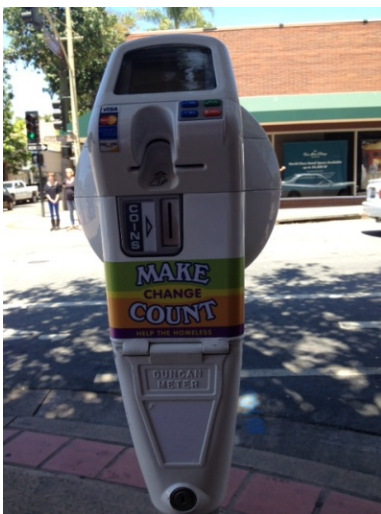
One of the new "Make Change Count" meters in downtown San Luis Obispo

Non-Profit Organization U.S. Postage PAID San Luis Obispo, CA Permit No. 325