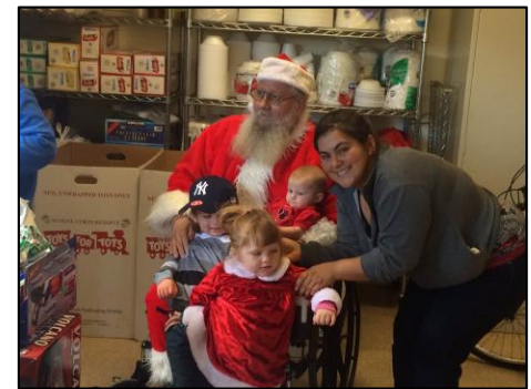
The children at the Christmas Eve gift giving were greeted by Santa – on wheels!