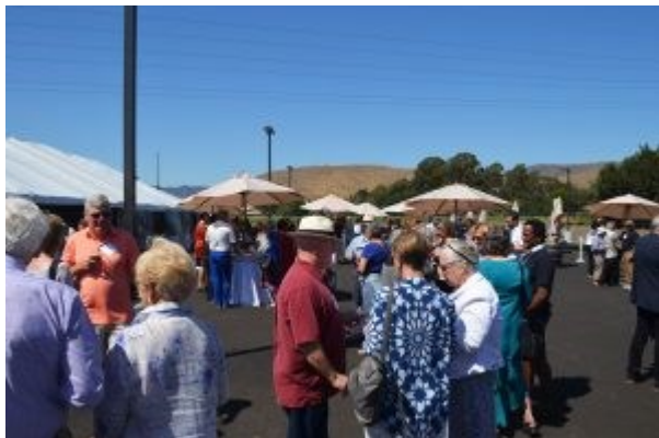
Food, fun and camaraderie at Community in Concert.

Friends of 40Prado is a 501(c)(3) nonprofit corporation, tax ID 77-0540323. We provide support funding for Prado Day Center and Maxine Lewis Memorial Shelter. CAPSLO manages their day-to-day operations. The People's Kitchen coordinates hot lunches served daily at Prado Day Center by organizations throughout the county.