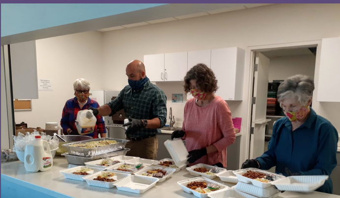
Getting ready to serve lunch at 40 Prado.

Non-Profit Organization U.S. Postage PAID Paso Robles, CA Permit No. 163