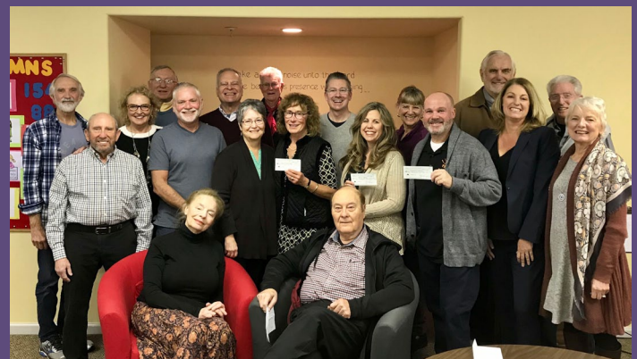
Thank you Ministerial Association!