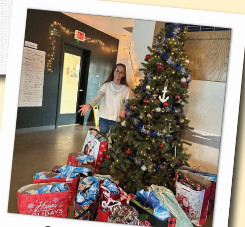
St. Stephen's Church