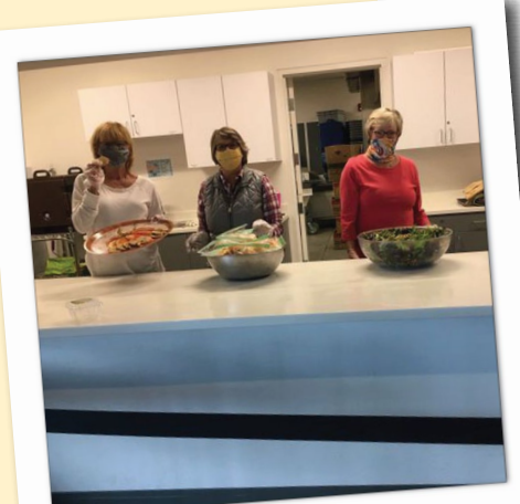
People's Kitchen & Volunteers