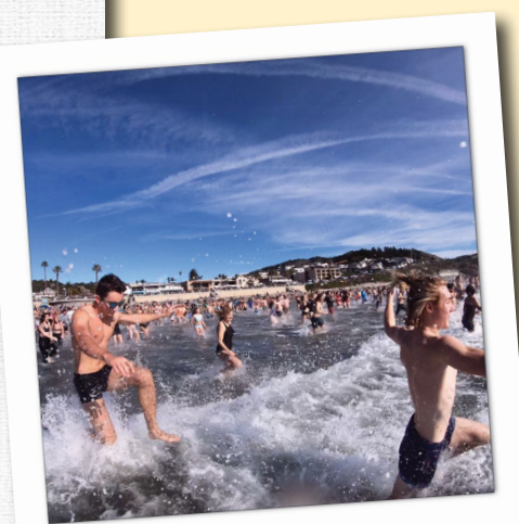
Polar Bear Plunge

Avila Beach Polar Bear Plunge regularly donates the proceeds from the sale of their commemorative T-Shirts to Friends of 40 Prado.