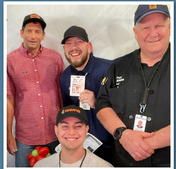
40 Prado Kitchen Team