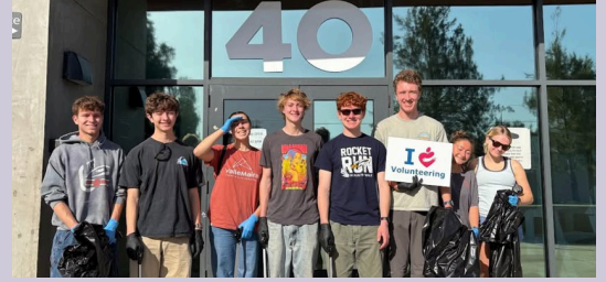
Cal Poly Distance Club

Friends of 40 Prado is a 501(c)(3) nonprofit corporation, tax ID 77-0540323. We provide support funding for 40 Prado Homeless Services Center. CAPSLO manages their day-to-day operations. The People's Kitchen coordinates hot lunches served daily at 40 Prado by organizations throughout the county.